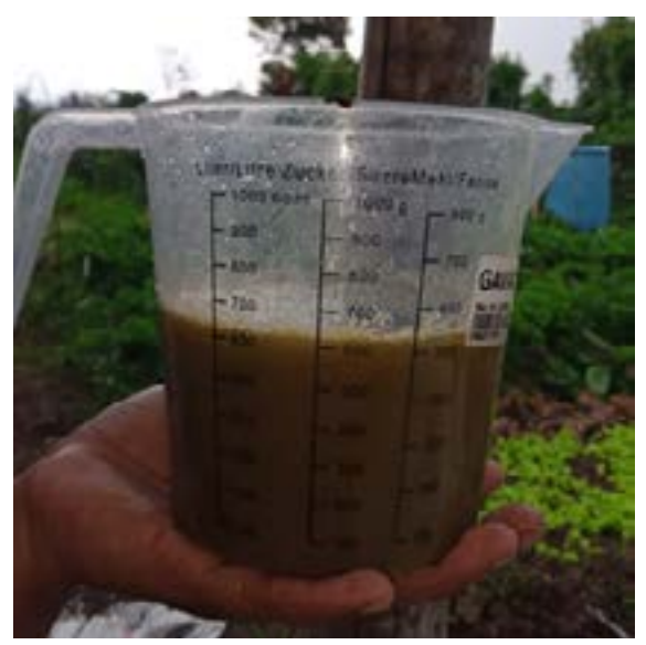
Figure 1. Gamal leaves-based liquid organic fertilizer (LOF)

The Gamal leaves-based LOF that was produced in this syudy had a brownish green colour and a pungent smell (Figure 1).