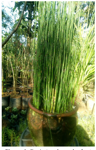
Figure 1. Equisetum hyemale plant

Plant types also became the factor that supports the success of wastewaster treatment. The plants need to have endurance towards the extreme environment, and be able to accumulate pollutants. Equisetum hyemale or locally known as Scouring-rush horsetail, is a decorative plant belonging to the Equisetaceae family. E. hyemale can grow in various places, is easy to care for, and has a good endurance towards external influence (Margowati and Abdullah, 2016), besides it's utilization in treating various kinds of wastes such as households, metals, tannery, and